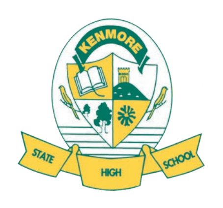
Education for Life